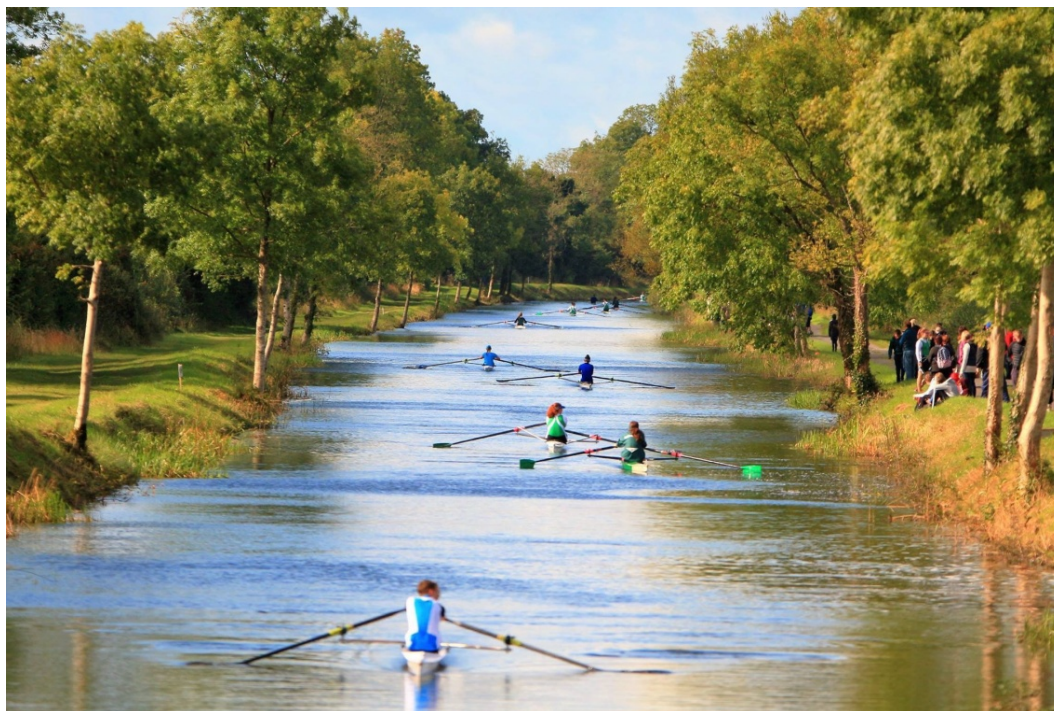
Tullamore Time Trial, Grand Canal, October 2016

An NSMC Inland Waterways meeting took place in Armagh on 24 June. Chris Hazzard MLA, Minister for Infrastructure, Paul Givan, MLA, Minister for Communities and Sean Kyne TD, Minister of State for Gaeltacht Affairs and Natural Resources attended the meeting.