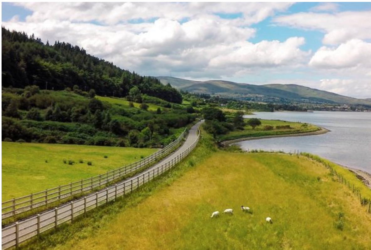
Carlingford Lough Greenway

An NSMC Transport meeting was held in Armagh on 12 December 2016. The meeting was attended by Shane Ross TD, Minister for Transport, Tourism and Sport, Chris Hazzard, MLA, Minister for Infrastructure and Junior Minister, Alastair Ross MLA.