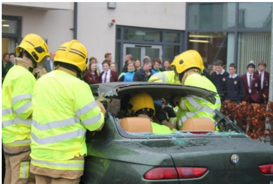
Northern Ireland Fire and Rescue Service personnel at the NSMC JS student outreach event in January 2016

After the presentations pupils from the participating schools had the opportunity to play the role of Ministers from the Executive and Irish Government by taking part in a mock North South Ministerial Council meeting to discuss road safety issues and agree future policies.