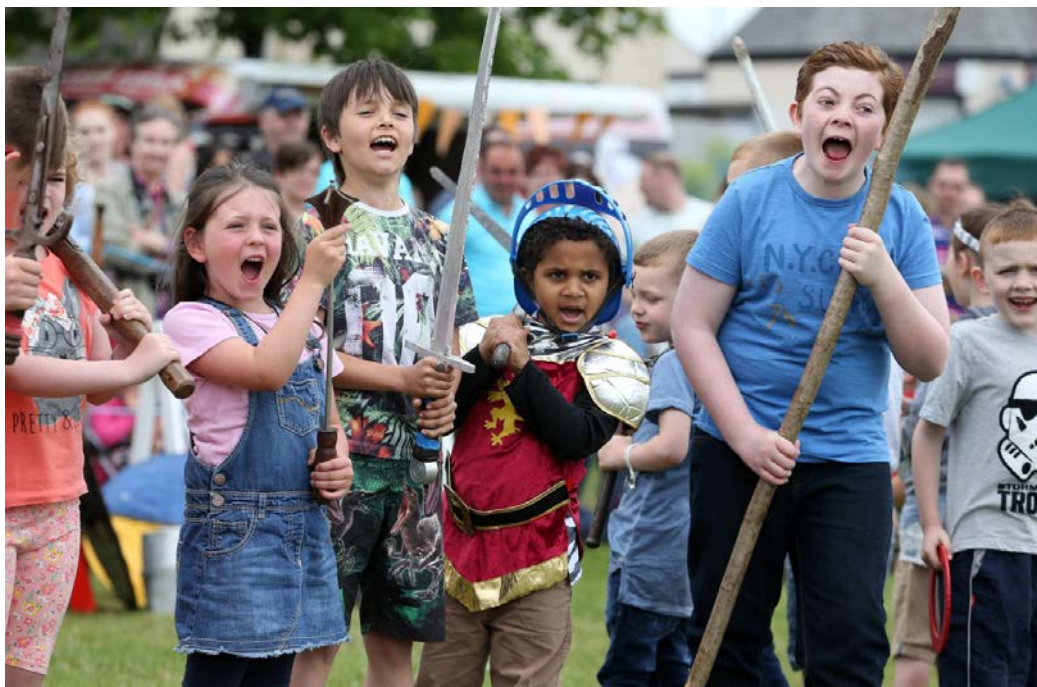
Soldiers of the King – Bruce Medieval Festival June 2016