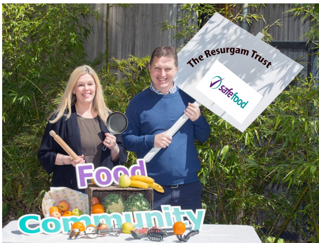
The Resurgam Trust project in Lisburn, one of 13 projects to receive funding from the Community Food Initiatives Programme 2016-18.