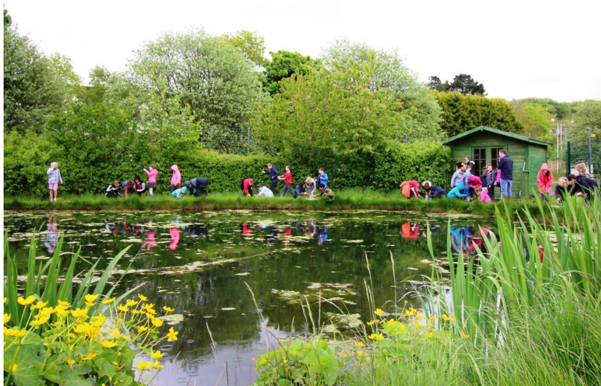
Primary school pupils pond dipping at Loughs Agency

An NSMC Aquaculture and Marine meeting was held on 14 September 2016 in Armagh. The meeting was attended by Denis Naughten TD, Minister for Communications, Climate Act and Environment, Michelle McIlveen MLA, Minister of Agriculture, Environment and Rural Affairs, Seán Kyne TD, Minister of State for Gaeltacht Affairs and Natural Resources and Chris Hazzard MLA, Minister for Infrastructure.