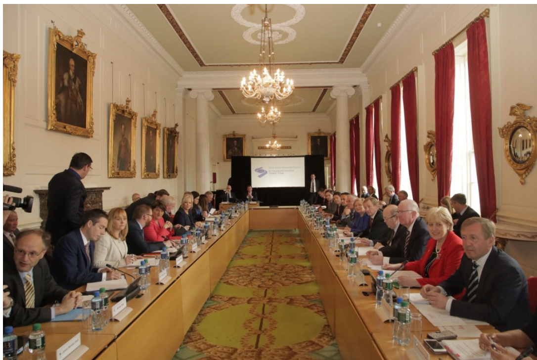
Ministers attending the NSMC Plenary in Dublin Castle on 4 July 2016

NSMC Plenary meetings involve Northern Ireland Executive and Irish Government Ministers meeting to take an overview of co-operation on the island and of the North South institutions.