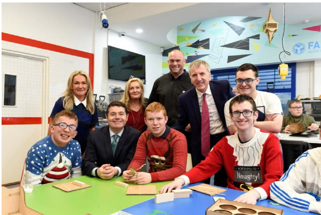
Ministers Paschal Donohoe TD, and Máirtín Ó Muilleoir MLA, visit the Nerve Centre, which was responsible for the delivery of the PEACE III funded 'Teaching Divided Histories' and 'Fab Lab' projects