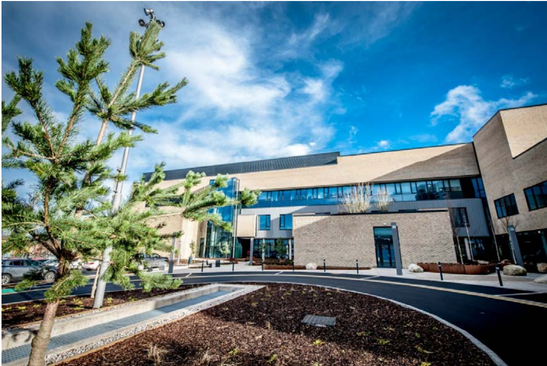
New Radiotherapy Unit at Altnagelvin Area Hospital