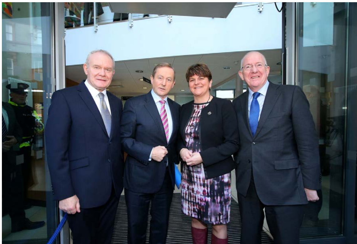
Deputy First Minister Martin McGuinness MLA, Taoiseach Enda Kenny TD, First Minister Rt Hon Arlene Foster MLA and Charles Flanagan TD, Minister for Foreign Affairs and Trade arriving for the NSMC Plenary meeting in Armagh on 18 November 2016

Senior Officials from both jurisdictions continue to meet to take forward the various commitments under Fresh Start and Ministers agreed that further progress updates will be brought to future NSMC meetings.