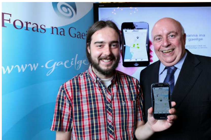
Launch of Irish Language app

Ministers acknowledged the ongoing co-operation with the independent offices of the Comptrollers & Auditors General in both jurisdictions, as a result of which 11 consolidated Annual Reports and Accounts for the Language Body have been published in the period from 2005 to date.