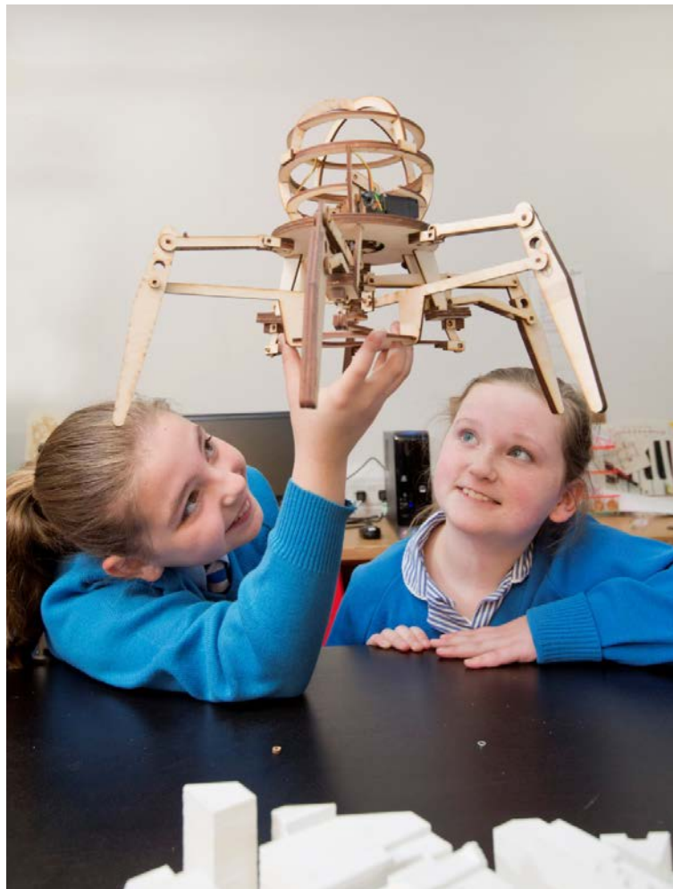
Primary school pupil's visting the PEACE III Programme funded Fab Lab in Belfast