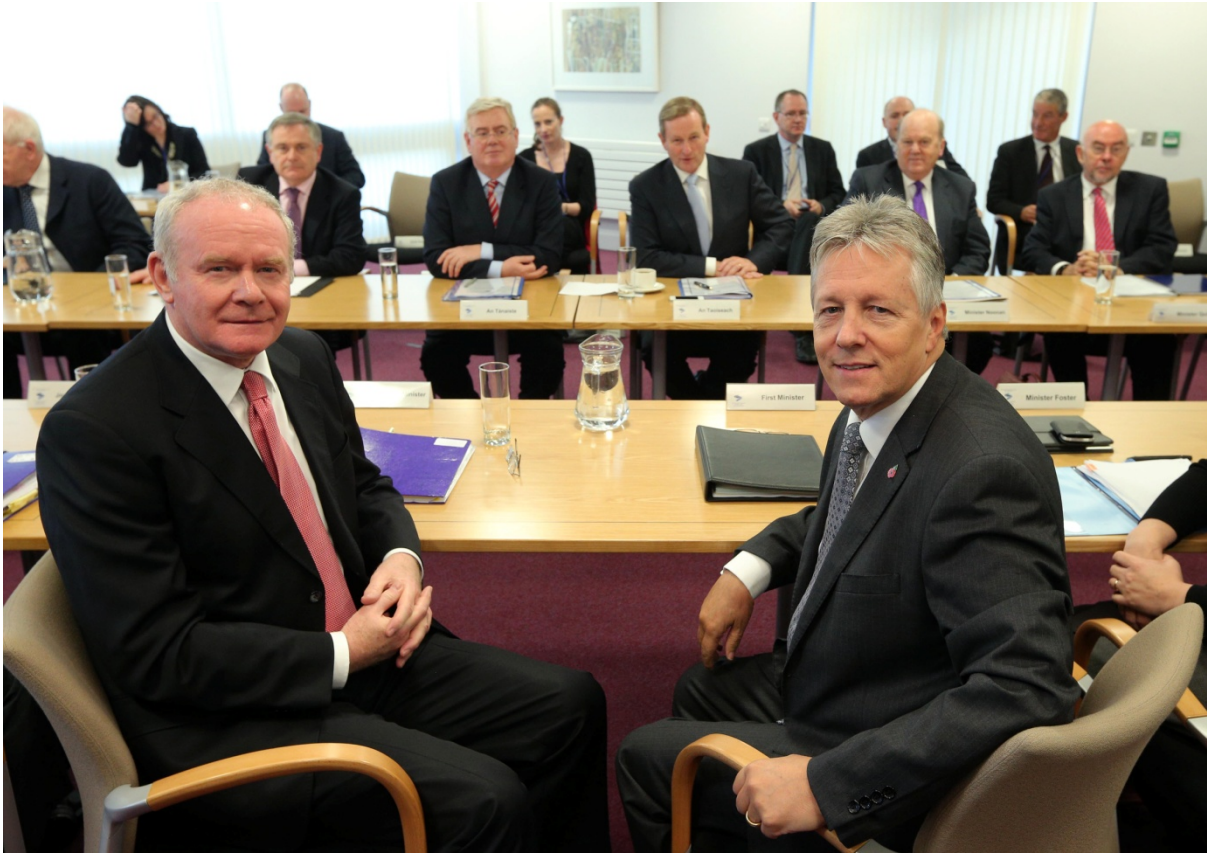
Ministers at the NSMC Plenary meeting in Armagh on 8 November 2013

NSMC Plenary meetings involve Executive Ministers meeting with their counterparts in the Irish government to overview the co-operation and work of the North South Ministerial Council. There were two NSMC Plenary meetings in 2013, the first on 5 July in Dublin Castle and the second on 8 November 2013 at the NSMC Joint Secretariat Offices in Armagh.