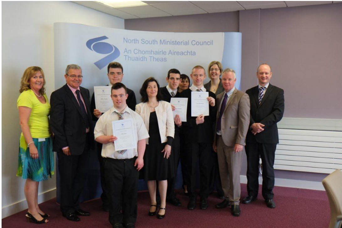
Pupils from Lisanally Special School receiving their work placement certificates from NSMC JS personnel

As part of its Corporate Social Responsibility Programme the Joint Secretariat arranges various outreach activities for local groups.