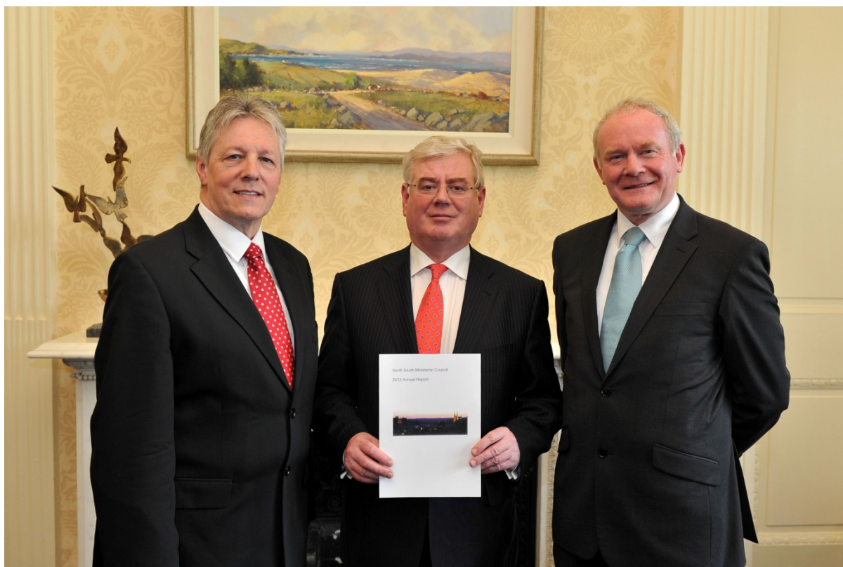
The First Minister, Tánaiste and Deputy First Minister launch the 2012 NSMC Annual Report at the Institutional Meeting in April.

The NSMC met in Institutional format on 29 April 2013 in Stormont Castle, Belfast. The First Minister the Rt Hon Peter Robinson MLA, the deputy First Minister Martin McGuinness MLA and the Tánaiste and Minister for Foreign Affairs and Trade, Eamon Gilmore TD attended the meeting. A copy of the Joint Communiqué issued after the meeting is available at www.northsouthministerialcouncil.org