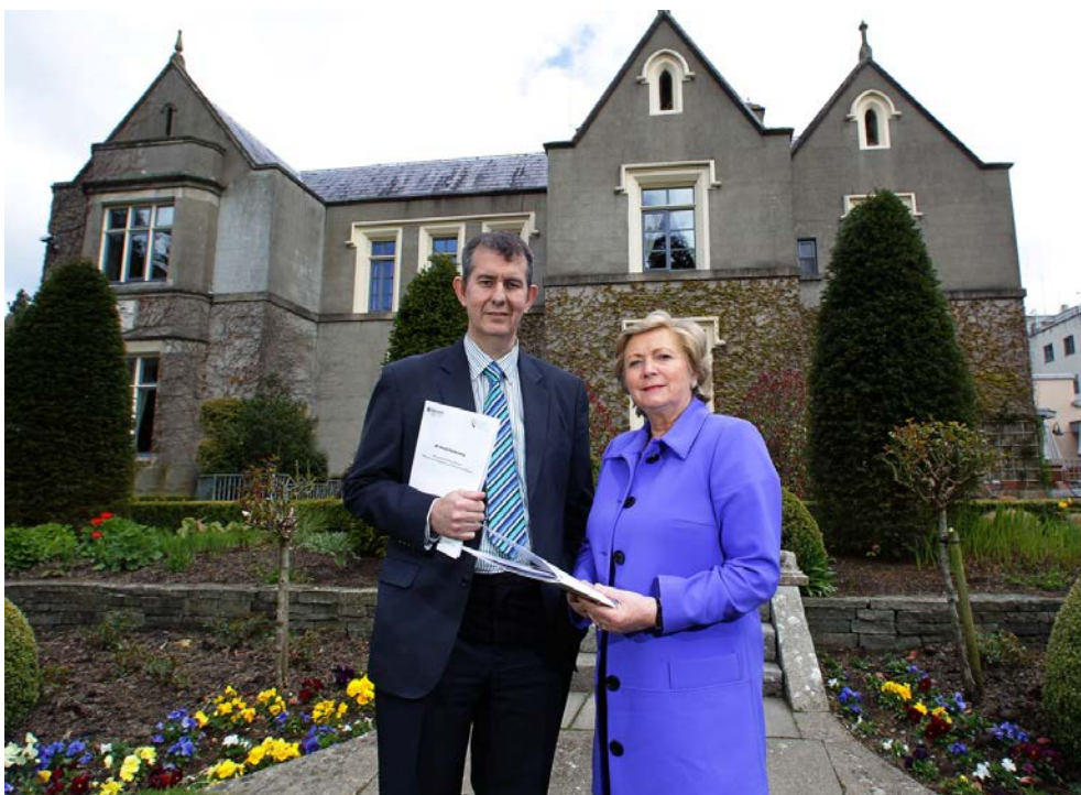
Minister Poots and Minister Fitzgerald attending the Child Protection Conference in Dundalk in May 2013