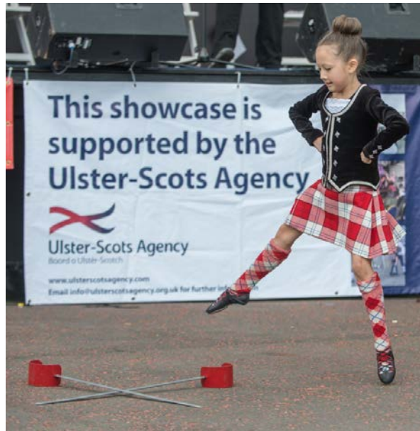
The Lagan Hooley – an Ulster-Scots event