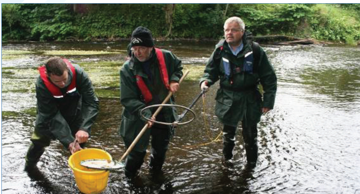
Fishery Officers electrofishing on the River Roe