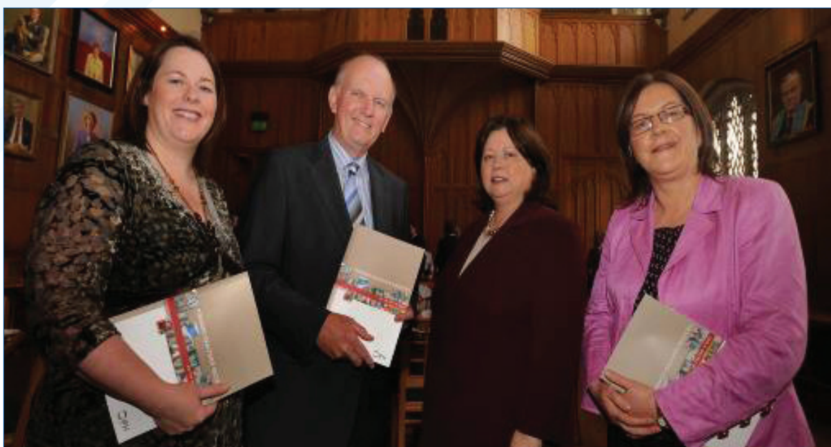
Left to Right Michelle Gildernew MP, MLA, Minister of Agriculture and Rural Development, Michael McGimpsey, MLA Minister for Health, Social Services and Public Safety, Mary Harney TD, Minister for Health and Children and Mary Wallace, TD, Minister of State with special responsibility for Health Promotion and Food Safety.