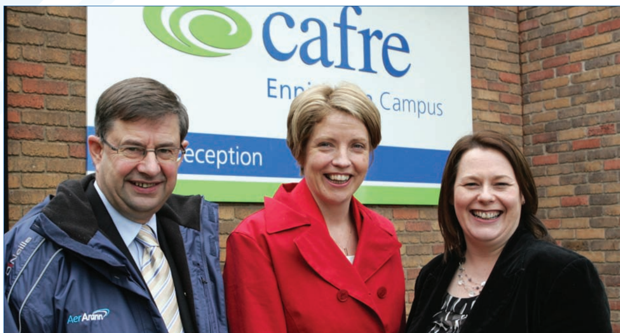
Left to Right – Éamon Ó Cuív TD, Minister for Community, Rural and Gaeltacht Affairs, Mary Coughlan TD, Minister for Agriculture, Fisheries and Food and Michelle Gildernew, MP, MLA, Minister of Agriculture and Rural Development