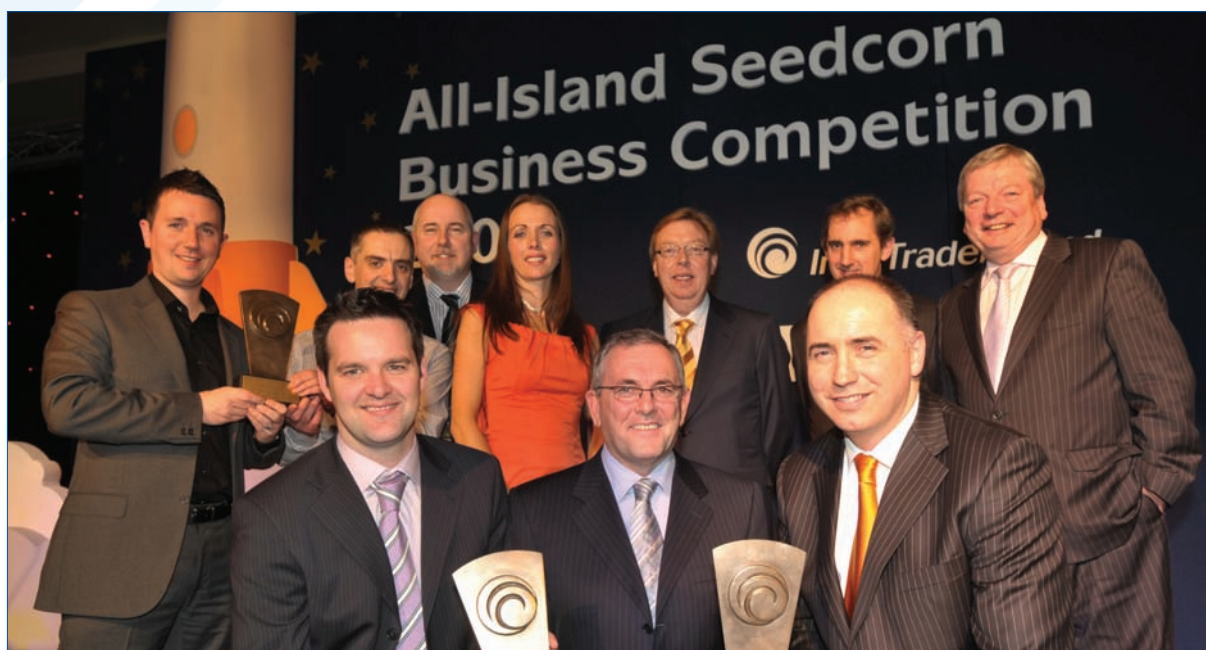
InterTradelreland’s Seedcorn Business Competition o8 winners Mcor Technologies and Media Lightbox pictured with Trade & Commerce Minister John McGuinness TD.