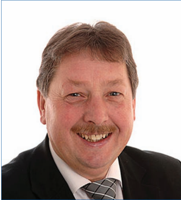
Left - Sammy Wilson MP, MLA, Minister of the Environment.