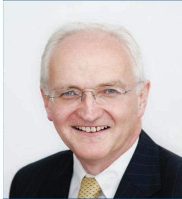
Right - John Gormley TD, Minister for the Environment, Heritage and Local Government.