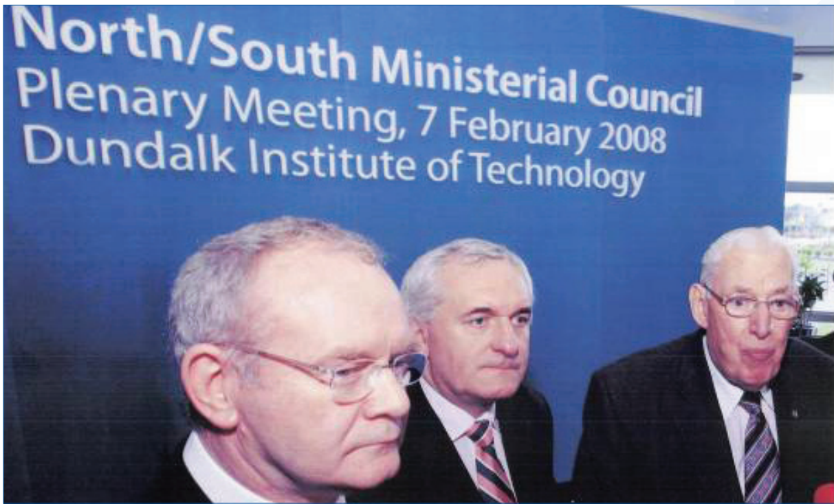
Pictured at the NSMC Plenary Meeting in Dundalk are deputy First Minister Martin McGuinness, MP, MLA, An Taoiseach, Bertie Ahern and First Minister The Right Hon Ian Paisley, MP, MLA.

2.1 The NSMC met in Plenary format at the Dundalk Institute of Technology on 7th February. The Irish Government delegation was led by the Taoiseach, Bertie Ahern TD who chaired the meeting. The Northern Ireland Executive delegation was led by the First Minister, The Rt Hon Dr Ian Paisley MP, MLA and deputy First Minister, Martin McGuinness MP, MLA.