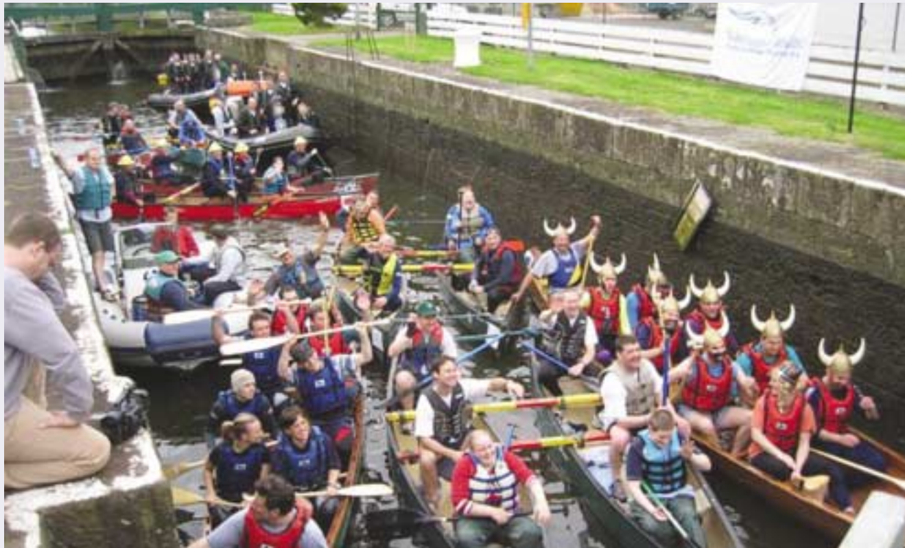
Special Olympics Canoe Challenge on the Lower Bann