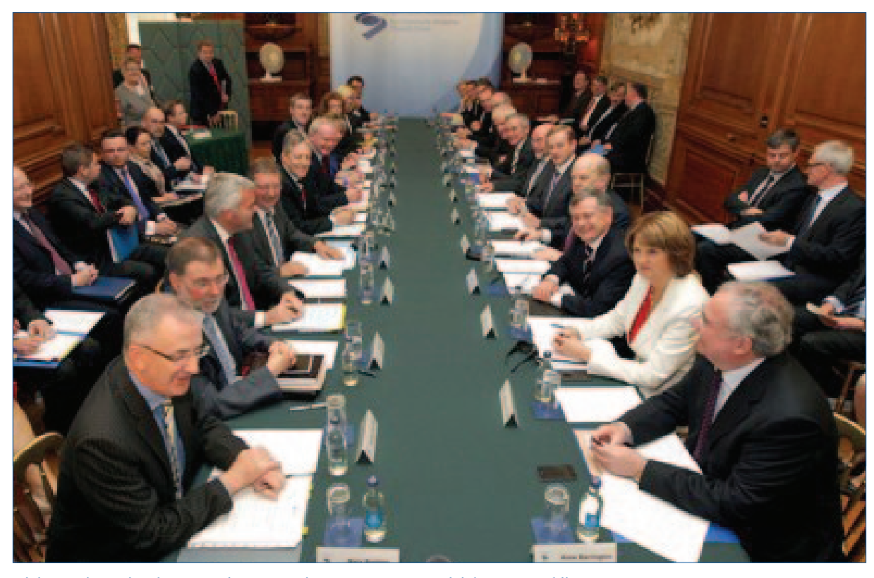
{\bf Ministers\ pictured\ at\ the\ NSMC\ Plenary\ meeting\ 1o\ June\ 2011,\ Farmleigh\ House,\ Dublin}