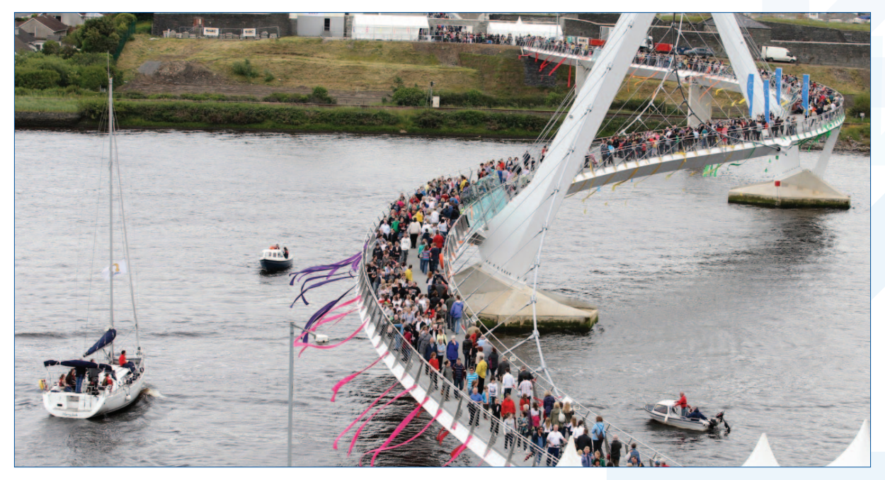
Launch of the Peace Bridge over the River Foyle which received funding of €14 million from the SEUPB PEACE III Programme.

noted that SEUPB would continue to work with the groups to develop further projects;