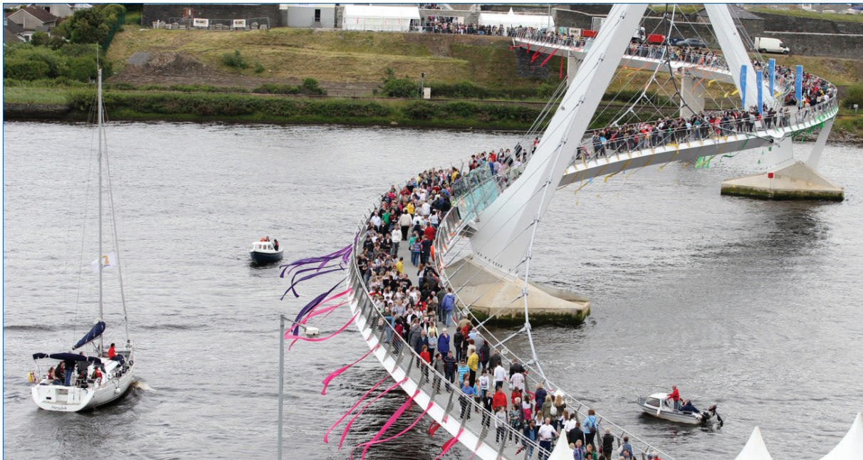
Furthpit o the Peace Brig ower the River Foyle at taen in fundin o €14 million frae the SEUPB PEACE III Program.