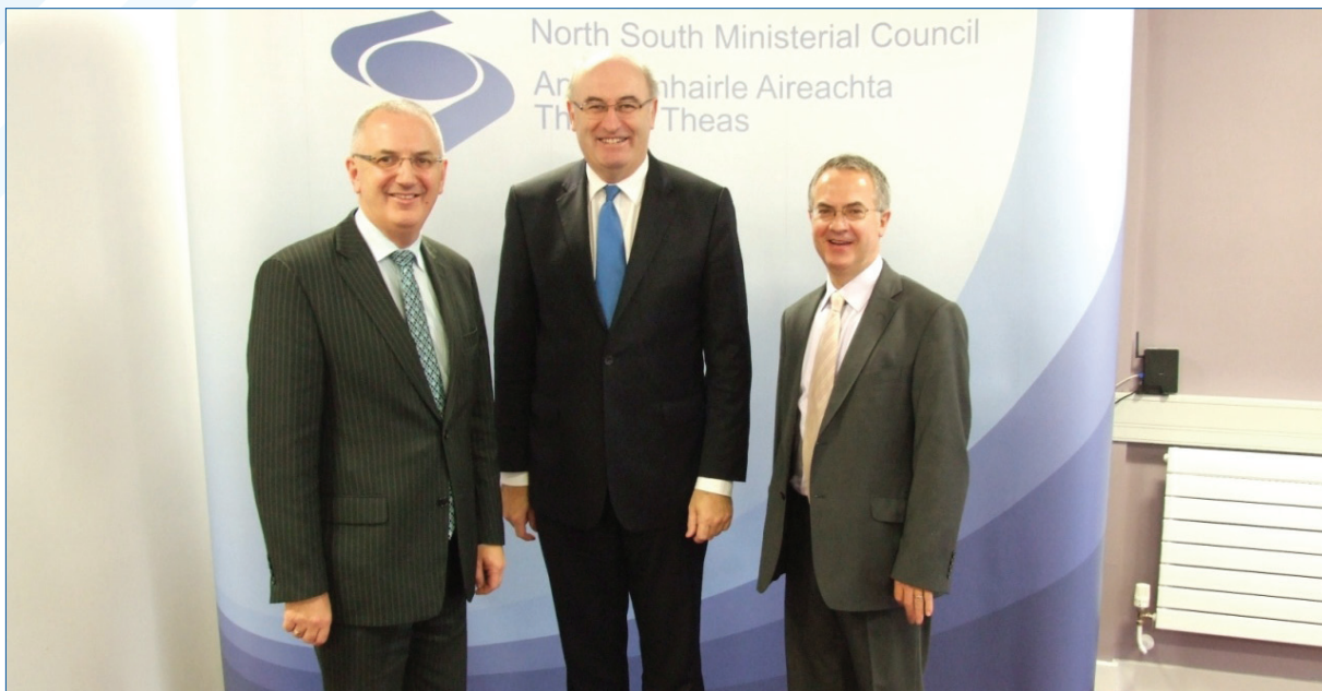
Left to right: Danny Kennedy MLA, Minister for Regional Council, Phil Hogan TD, Minister for the Environs, Commontie an Haemlie Govrenment an Alex Attwood MLA, Minister o the Environs at the NSMC Environs forgaither in Armagh on 1 Julie 2011.

2.3.1 The war twa NSMC Environs forgaithers in 2011 on the 1 Julie an 21 October. The forgaithers haen at thaim Phil Hogan TD, Meinister for the Environs, Commontie an Haemlie Govrenment, Alex Attwood MLA, Meinister o the Environs, an Danny Kennedy MLA, Meinister for Regional Oncum.