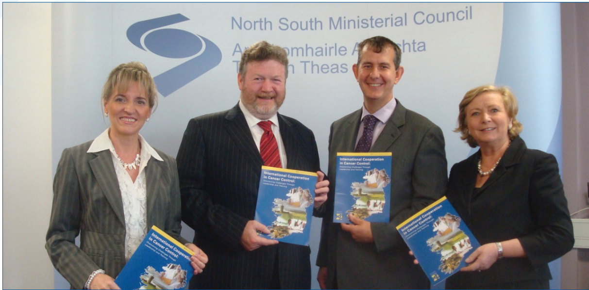
Pittan the Airlan-Norlin Airlan-National Cancer Institute Consortium yearlie daeins report for 2010 furth, left tae richt: OFMDFM Junior Meinister Martina Anderson MLA, James Reilly TD, Meinister for Halth, Edwin Poots MLA, Meinister o Halth, Social Services an Public Sauttie, an Frances Fitzgerald TD, Meinister for Bairns an Youth Daeins at the NSMC Halth an Meat Sauttie forgaiter in Armagh on 20 Julie 2011.

2.4.1 The NSMC Halth an Meat Sauttie forgaiter wis on the 20 Julie 2011. James Reilly TD, Meinister for Halth, Frances Fitzgerald TD, Meinister for Bairns an Youth Daeins, Edwin Poots MLA, Meinister for Halth, Social Services an Public Sauttie, an Martina Anderson MLA, Junior Meinister, OFMDFM cam tae the forgaiter.