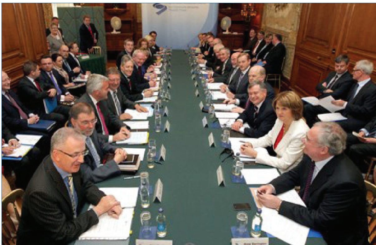
Meinisters in pictur at the NSMC Plenarie forgaither 10 Juin 2011, Farmleigh Houss, Dublin