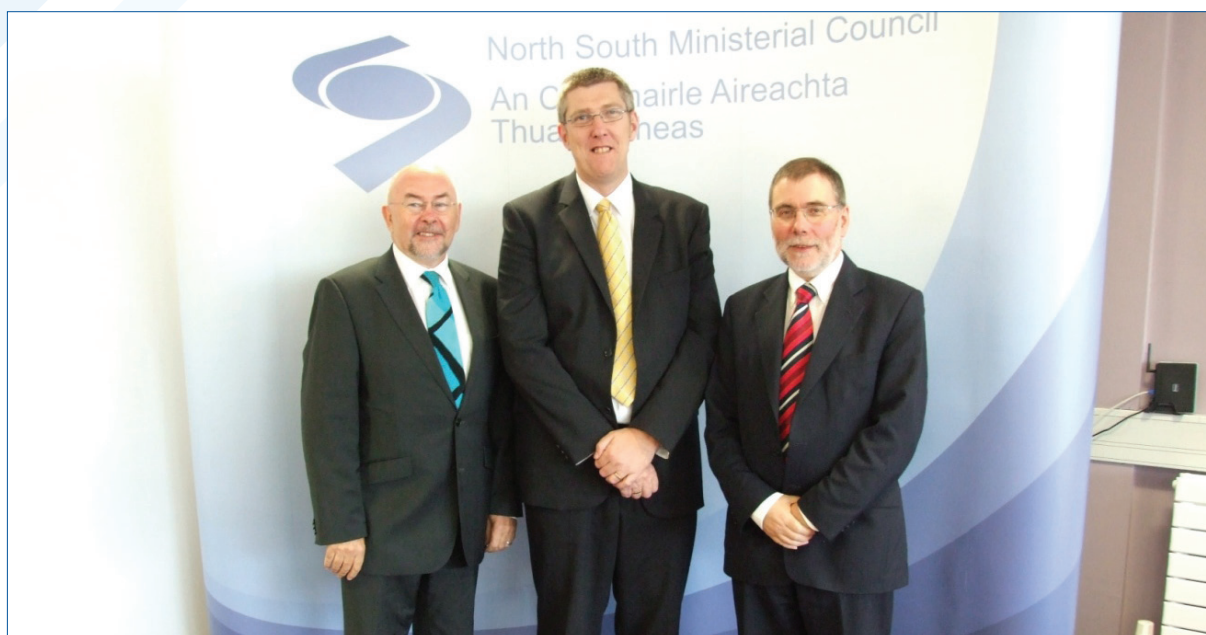
Left to right: Ruairí Quinn TD, Minister for Lear an Skeils, John O'Dowd MLA, Minister o Lear, Nelson McCausland MLA, Minister for Social Oncom at the NSMC Lear forgaither in Armagh on 21 September 2011.

2.2.1 The war twa NSMC Lear forgaithers in 2011 on the 21 Januar an 21 September. Mary Coughlan TD, Tánaiste an Meinister for Lear an Skeils, Caitríona Ruane MLA, Meinister for Lear an Danny Kennedy MLA, Meinister for Employ an Learnin cam tae the 21 Januar forgaither. John O'Dowd MLA, Meinister for Lear, Ruairí Quinn TD, Meinister for Lear an Skeils an Nelson McCausland MLA, Meinister for Social Oncom cam tae the 21 September forgaither.