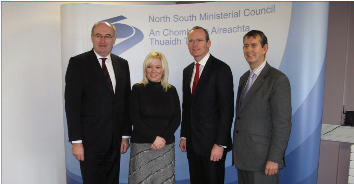
Left to right: Phil Hogan TD, Minister for the Environs, Commontie an Haemlie Govrenment, Michelle O'Neill MLA, Minister o Agricultur an Laundart Oncum, Simon Coveney TD, Minister for Agricultur, Meat an the Marine, an Edwin Poots MLA, Minister o Halth, Social Services an Public Sauffie, at the NSMC Agricultur forgaitheer in Armagh on 26 October 2011.

2.1.1 NSMC Agricultur forgaitheers cam aff 26 Julie 2011 an 26 October 2011. Michelle O'Neill MLA, Minister o Agricultur an Laundart Oncum, Edwin Poots MLA, Minister o Halth, Social Services an Public Sauffie, an Simon Coveney TD, Minister for Agricultur Meat an the Marine cam tae the baith forgaitheers. Phil Hogan TD, Minister for the Environs, Commontie an Haemlie Govrenment cam tae the October forgaitheer.