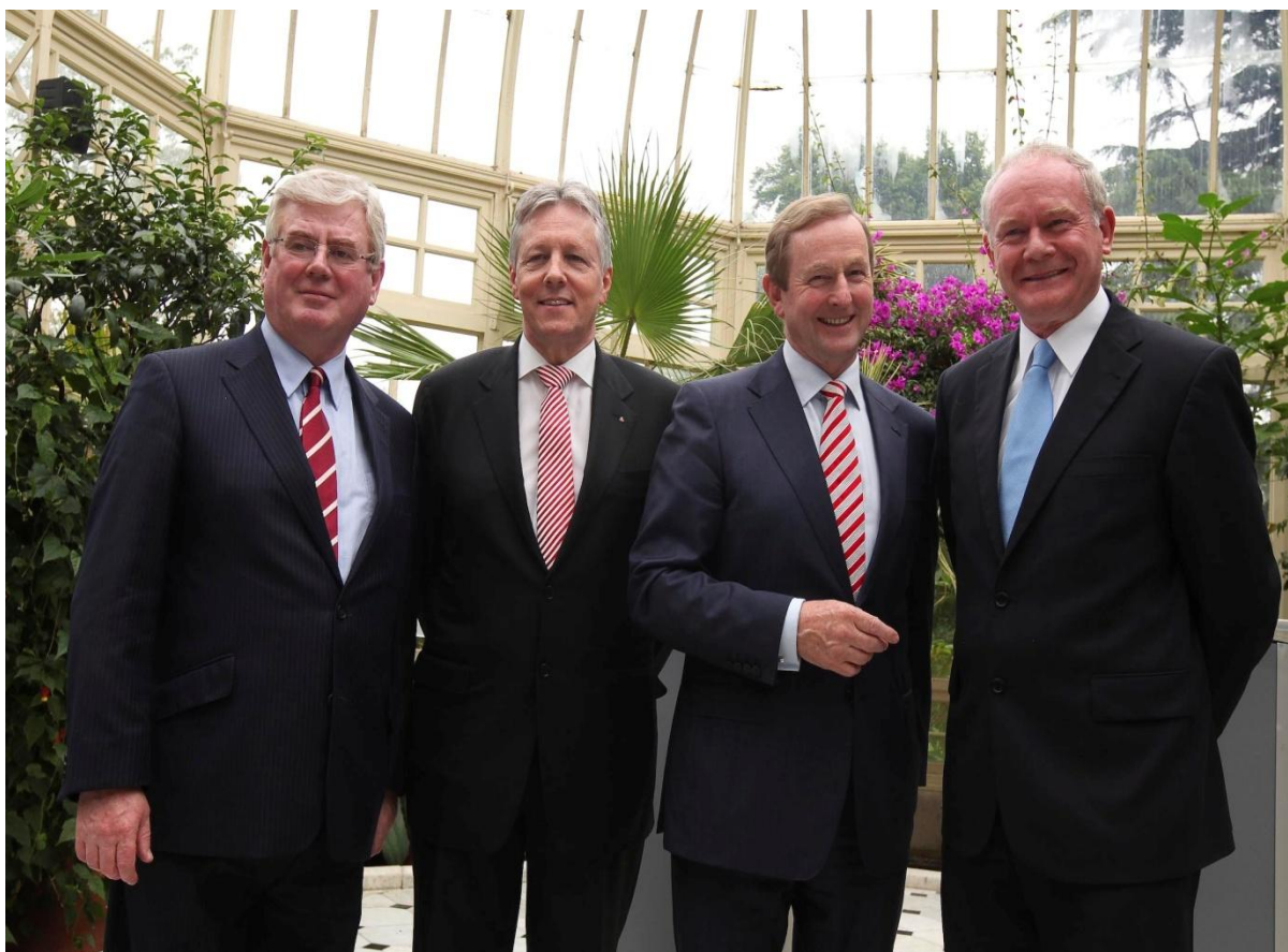
Eamonn Gilmore TD, Tánaiste and Minister for Foreign Affairs and Trade, the Rt Hon Peter Robinson MLA, First Minister, Enda Kenny TD, Taoiseach and Martin McGuinness MLA, deputy First Minister at the June Plenary Meeting in Dublin