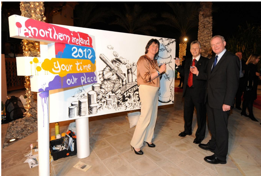
Left to right: Arlene Foster MLA, Minister for Enterprise, Trade and Investment, the Rt Hon Peter Robinson MLA, First Minister and Martin McGuinness MLA, deputy First Minister at northern ireland 2012 your time our place .