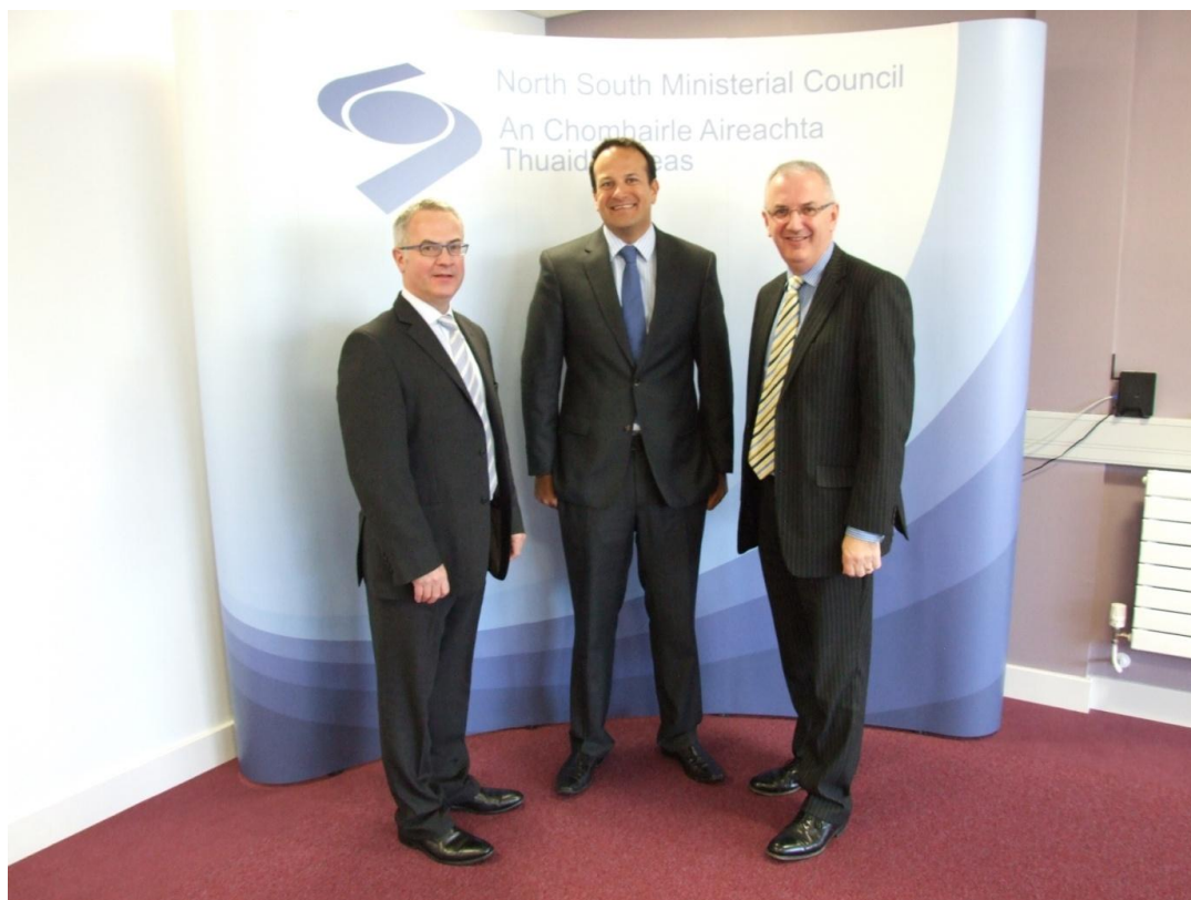
Left to right: Alex Attwood MLA, Minister of the Environment, Leo Varadkar TD, Minister for Transport, Tourism and Sport and Danny Kennedy MLA, Minister for Regional Development at the NSMC Transport Meeting 20 April 2012.

There were two NSMC Transport meetings on 20 April 2012 and on 5 October 2012. Minister Varadkar TD, Minister for Transport, Tourism and Sport, Minister Kennedy MLA, Minister for Regional Development and Minister Attwood MLA, Minister of the Environment attended both meetings.