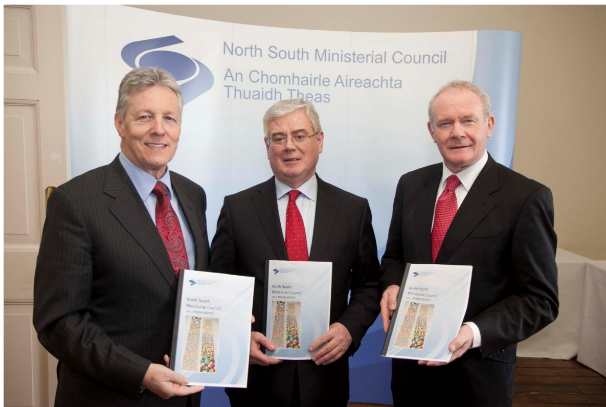
The Rt Hon Peter Robinson MLA, First Minister, Eamonn Gilmore TD, Tánaiste and Minister for Foreign Affairs and Trade and Martin McGuinness MLA, deputy First Minister at the April Institutional Meeting in Dublin.

The NSMC met in Institutional format on 27 April 2012 in the Royal Hospital, Kilmainham, Dublin. The Tánaiste and Minister for Foreign Affairs and Trade, Eamon Gilmore TD, First Minister the Rt Hon Peter Robinson MLA and the deputy First Minister Martin McGuinness MLA, attended the meeting. A copy of the Joint Communiqué issued after the meeting is available at www.northsouthministerialcouncil.org