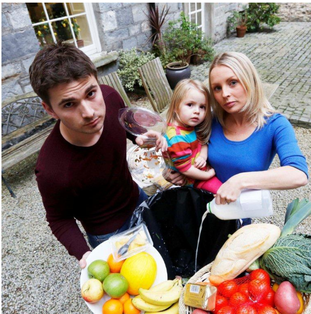
Campaign urging consumers to check the dates and cut food waste

The NSMC meets on Food Safety matters to take decisions on policies and actions to be implemented by the Food Safety Promotion Board (FSPB). FSPB operates under the brand identifier 'safefood'. It has an Advisory Board of 12 members, appointed by the NSMC, principally charged with promoting food safety and supporting scientific co-operation between institutions working in that field.