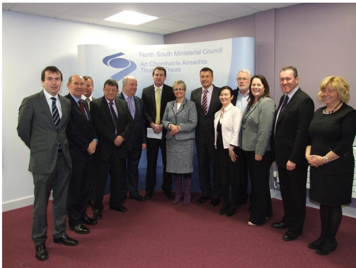
Representatives of the 'Joint Committee on the Implementation of the Good Friday Agreement' on their visit to the NSMC JS Offices in Armagh on 12 January 2012.

In addition to the North South Ministerial Council Joint Secretariat's core function of supporting the NSMC, personnel engage in various activities designed to engage with stakeholders and the local community. The Joint Secretariat aims to promote the Joint Secretariat Offices in Armagh and the work undertaken both by the Joint Secretariat and the NSMC. During the year the Joint Secretariat arranged a number of events to support this role.