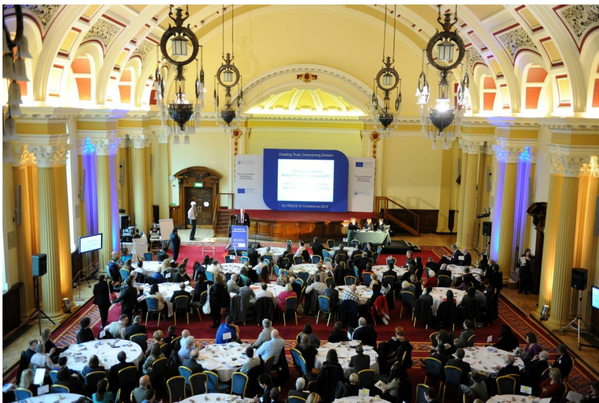
Delegates at the PEACE III Conference, which took place in Belfast City Hall on Tuesday 13 November 2012