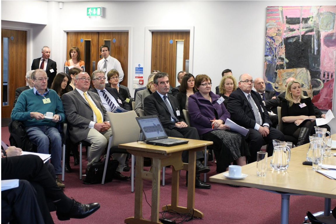
Delegates at the 'Induction for new Board Members' in the NSMC Joint Secretariat Offices in Armagh in January 2012

On 18 January the NSMC JS hosted a successful induction event at the offices in Armagh for the newly appointed Board members of the North South Implementation Bodies and Tourism Ireland.