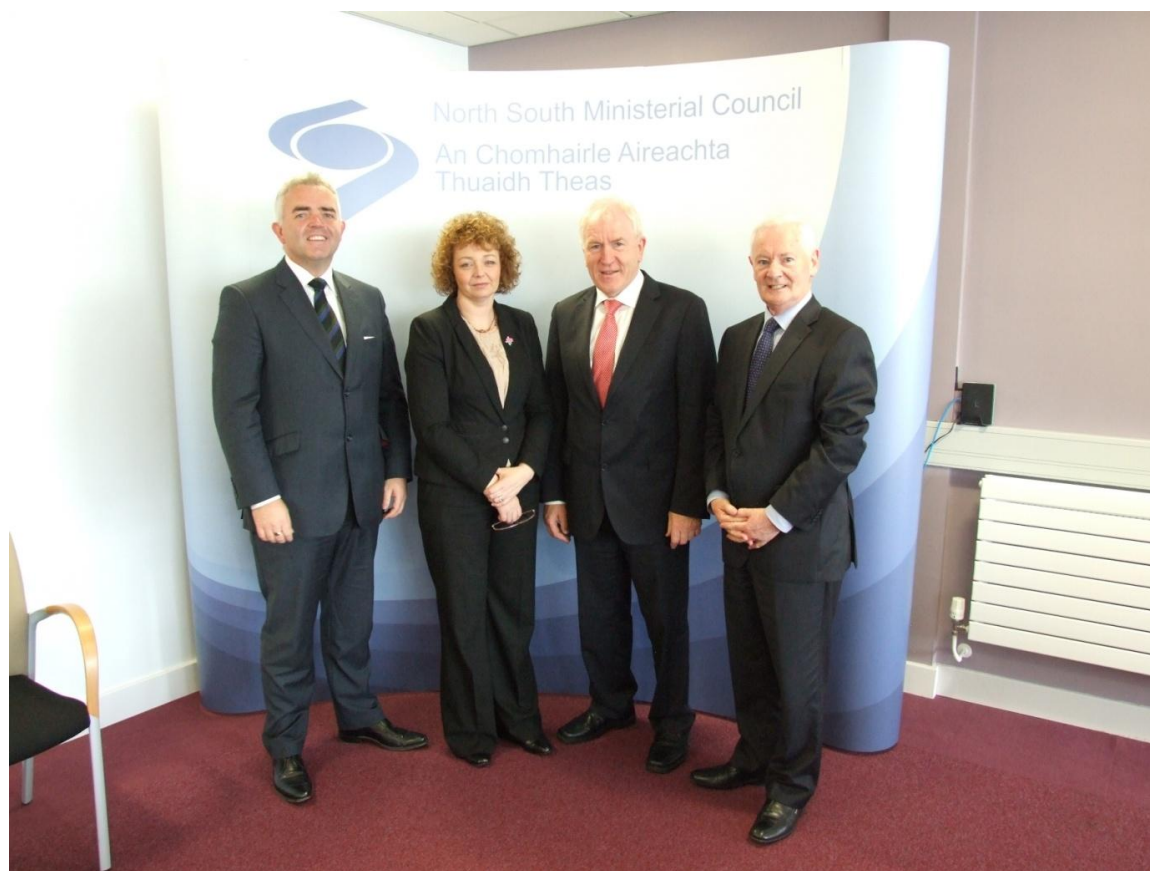
Left to right: OFMDFM Junior Minister Jonathan Bell MLA, Carál Ní Chuilín MLA, Minister of Culture Arts and Leisure, Jimmy Deenihan TD, Minister for Arts, Heritage and the Gaeltacht and Minister Dinny McGinley TD, Minister of State with special responsibility for Gaeltacht Affairs at the NSMC Waterways Ireland Meeting 9 July 2012.

Waterways Ireland is responsible for the management, maintenance, development and restoration of the inland navigable waterway systems throughout the island, principally for recreational purposes. It is currently responsible for the following waterways: Barrow navigation, Erne System, Grand Canal, Lower Bann Navigation, Royal Canal, Shannon-Erne Waterway and Shannon Navigation amounting to approximately 1,000km of navigable waterways. It is also responsible for the restoration of the section of the Ulster Canal between Clones and Upper Lough Erne and following restoration, for its management, maintenance and development. The Chief Executive of Waterways Ireland is Mr John Martin. Further details are available at www.waterwaysireland.org