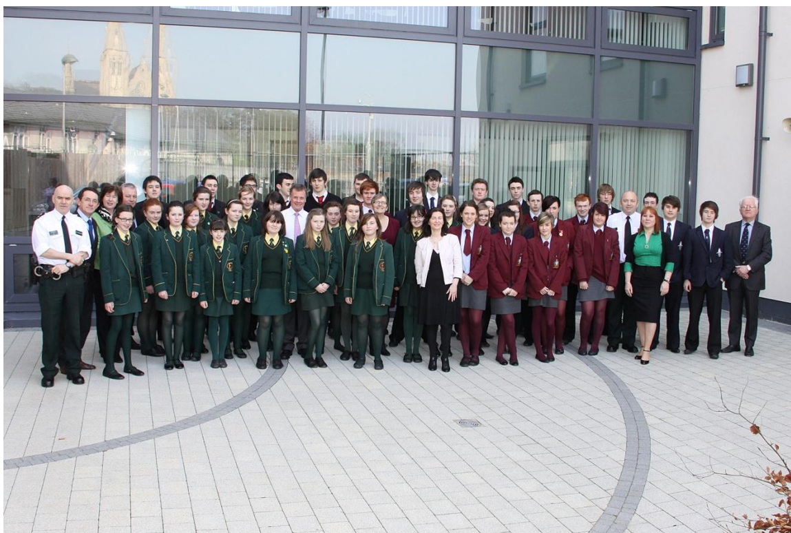
Participants at the Youth Programme in the Joint Secretariat offices on 22 March 2012

The Joint Secretariat recognised the importance of building links within the local community and in partnership with PSNI, Armagh City and District Council and Armagh Schools Forum, organised a Youth Programme involving fifty students from local post primary schools in the offices in Armagh on 12 March 2012.