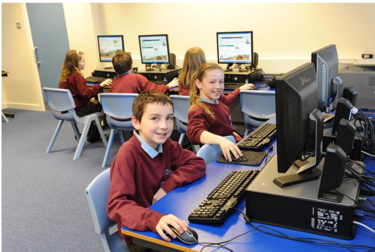
Primary school pupils making use of digital technologies as part of their everyday learning is now commonplace.

There were three NSMC Education meetings during 2012 on 1 March, 15 June and 17 October. John O'Dowd MLA, Minister for Education, Ruairí Quinn TD, Minister for Education and Skills and Nelson McCausland MLA, Minister for Social Development attended all meetings.