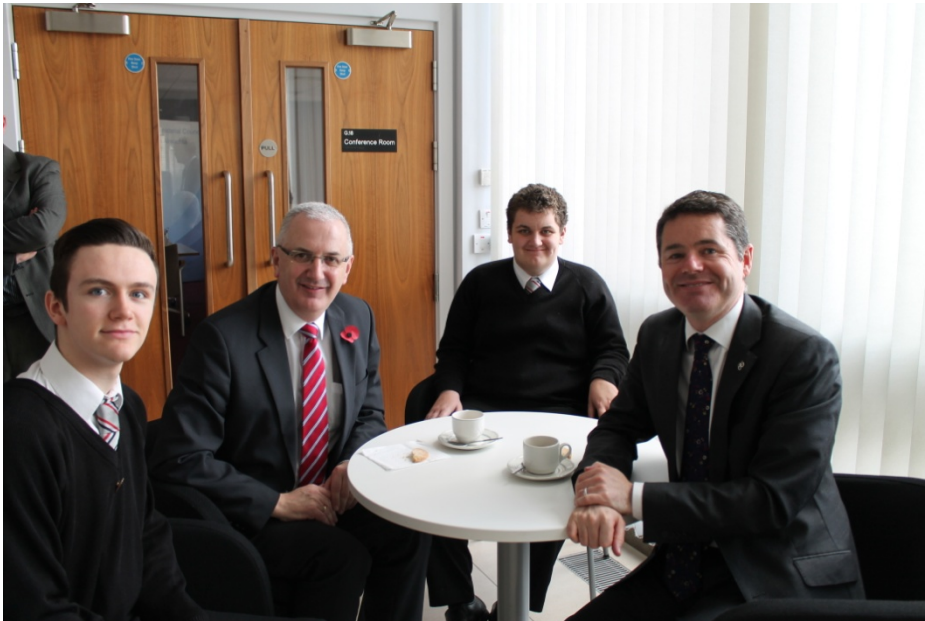
Minister Danny Kennedy MLA and Minister Pascal Donohoe, TD with Lisanally pupils at a NSMC Transport meeting in November 2014.

The Joint Secretariat also continued its engagement with Lisanally Special School in Armagh. The work experience project provides pupils with the opportunity to assist with arrangements and delivery of a number of NSMC meetings. This included being present for the arrival of Ministers and assisting with a diverse range of preparation duties and helping with the catering.