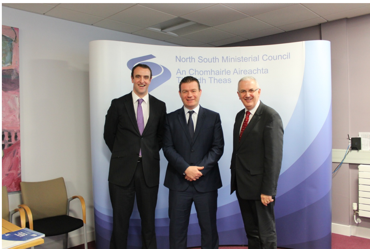
Minister Mark H Durkan, MLA, Minister Alan Kelly, TD and Minister Danny Kennedy, MLA at the NSMC Environment meeting in November 2014.