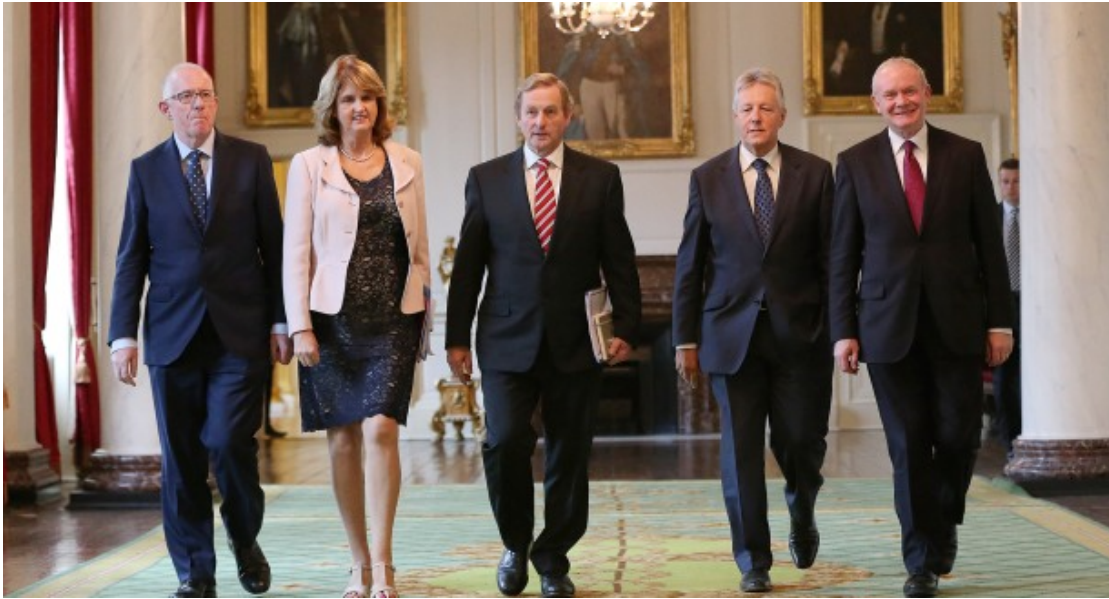
Minister Charlie Flanagan TD, Tánaiste Joan Burton TD, Taoiseach Enda Kenny TD, First Minister Rt Hon Peter Robinson MLA and deputy First Minister Martin McGuinness MLA at the NSMC Plenary in Dublin Castle, 3 October 2014