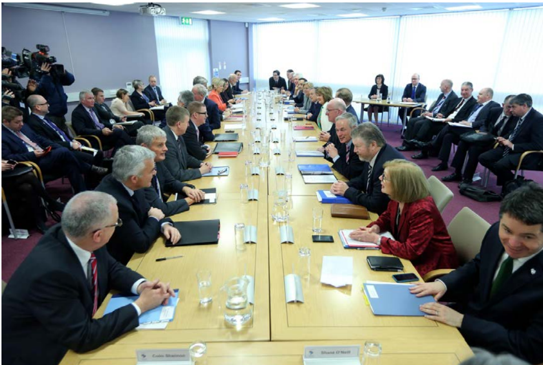
The NSMC Plenary in Armagh, 5 December 2014

NSMC Plenary meetings involve Executive Ministers meeting with their counterparts in the Irish Government to overview the co-operation and work of the North South Ministerial Council. There were two NSMC Plenary meetings in 2014, the first on 3 October in Dublin Castle and the second on 5 December at the NSMC Joint Secretariat Offices in Armagh.