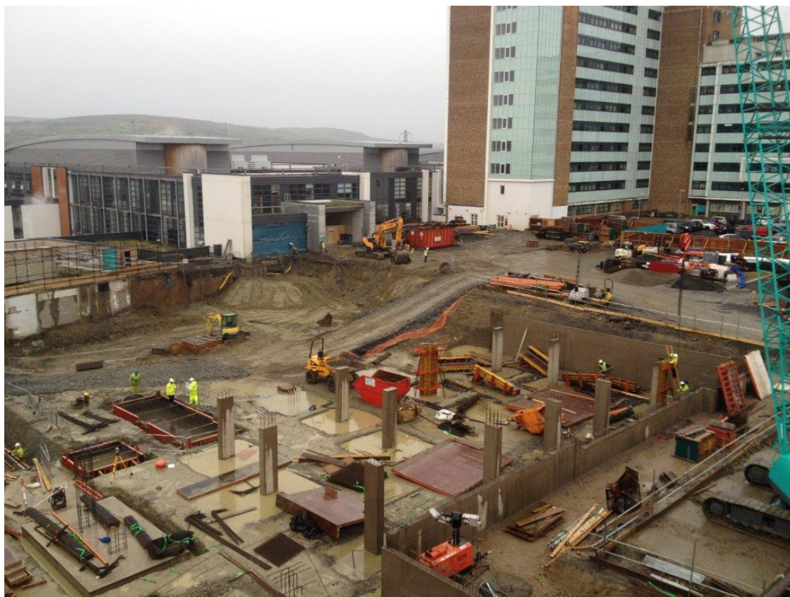
Construction underway at the Radiotherapy Centre at Altnagelvin Hospital, Derry.